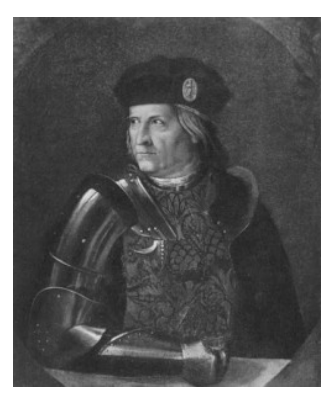
Portrait of Ercole I d'Este

1470—Siena, Italy: The chamberlain sends "the Palace's silver trombone" to goldsmiths Francesco di Antonio and company for repairs because "it is lacking certain things." The instrument is to be remade according to a design retained by the chamberlain and to be completed in time for Assumption Day festivities. The agreement also stipulates that, if the goldsmiths require more than the agreed upon amount of silver, it will be supplied by the Palace, in addition to any gold that may be needed for the instrument. The goldsmith later receives payment for gilding the trombone ( per doratura del tronbone ) (D'Accone, Civic Muse 554).