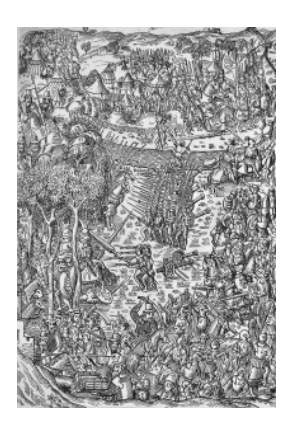
Anonymous print depicting Battle of Fornovo

1495—Venice, Italy: A motet for 5 voices by Obrecht is performed, accompanied by 2 trombones (Galpin, Sackbut).