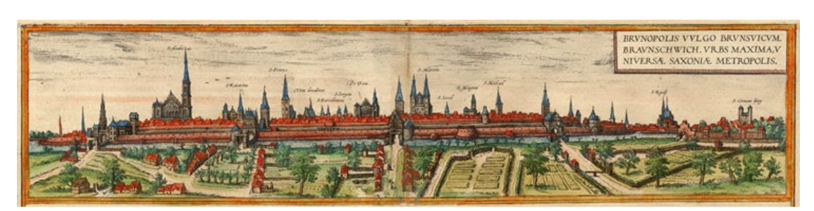
Brvnopolis vvlgo brvnsvicvm, bavnschwich, vrbs maxima, v niversa, saxonia metropolis.

Early 1400s—In German cities, according to Polk, "In the first decades of the fifteenth century the artistic energies of the civic wind players were centred on performance on shawms and trombone. Playing of other instruments may have been called for, but such doubling was distinctly secondary" (Polk, German 113).