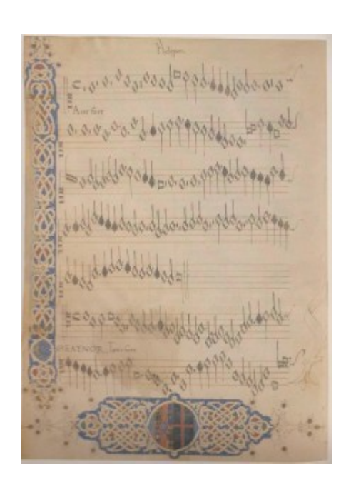
Page from the Casanatense manuscript