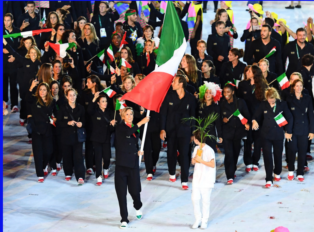
Giorgio Armani for Italy, 2016