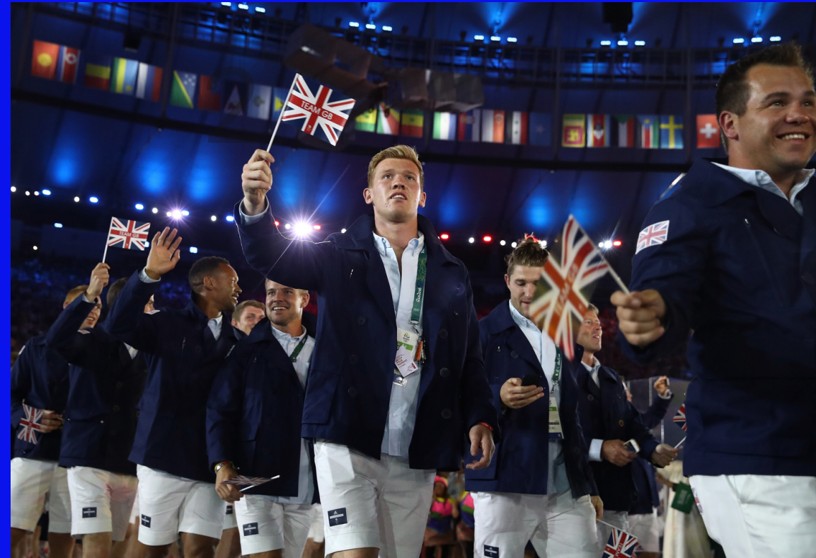
Adidas x Stella McCartney for Great Britain, 2016