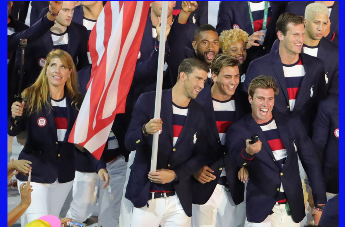
Ralph Lauren for USA, 2016